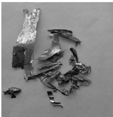
Figure 2 Copper cathode removed from a galvanized surface