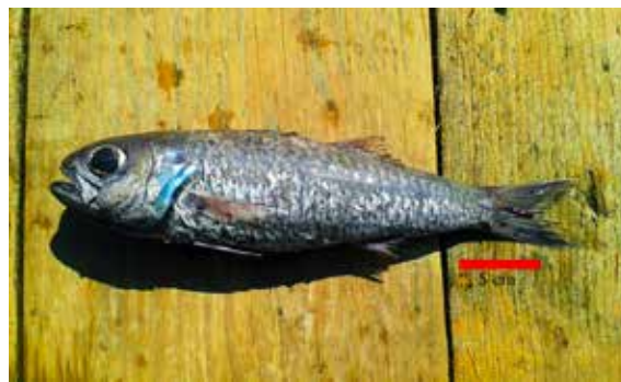
Fig. 2. Specimen of Synagrops japonicus caught during the tow. At the end of the caudal peduncle, on the left side of the beginning of the caudal fin the copepod Peniculus cf. fistula . The blue colour of the operculum is clearly visible. Scale bar: 5 cm

200 m depth for a time span of one hour (AA.VV., 2013; AA.VV., 2015). For four consecutive years, from January 2012 to August 2015, two tows of one hour each were carried out every three months at ca. 400 meters of depth (Fig. 1). During these fishing campaigns, a "new" fish unknown for the Mediterranean fauna was collected. In order to identify this species, various taxonomic references were used (HEEMSTRA, 1984, 1986, 2016; MEJIA et al. , 2001; SCHWARZHANS & PROKOFIEV, 2017).