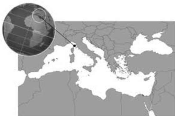
Fig. 1. Place where the cargo carrier 'Venezia' of the Grimaldi lines lost its load of drums, and where the individual of Synagrops japonicus was captured in August 2015