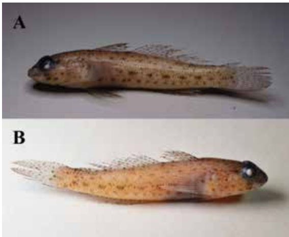
Fig. 2. Gobius incognitus , A) male, 44.7 + 10.3 mm, PMR VP5183; B) male, 40.1+8.3 mm; San Lowrenz, Gozo island, Malta, photographs by M. Kovačić (A) and O. Kotvun (B)

head canals present; 3) anterior dorsal row g of sensory papillae ends behind or on lateral end of row o ; 4) six suborbital transverse row c of sensory papillae, if seven, then predorsal area scaled.