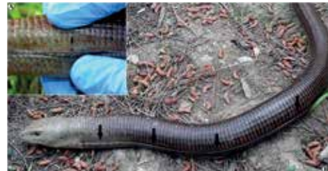
Figure 1. European glass lizard ( Pseudopus apodus ; Anguillidae) A. Nymph of Ixodes ricinus ; B. Arrow- Outline of lateral groove that was the tick attachment site

Three adult European glass lizards were caught in the garden of Faculty of Veterinary Medicine, Ondokuz Mayıs University, Samsun, Turkey in May 2020 and the presence of tick infestation was detected. Tick attachment site on the body was photographed with a Nikon Coolpix P610 Compact camera (Figure 1). The ticks were collected from the lateral groove on both sides of the lizard by using blunt tip tweezers (Figure 1A). Subsequently, all three hosts were released unharmed to a safe area. Tick samples were preserved in 70% ethyl