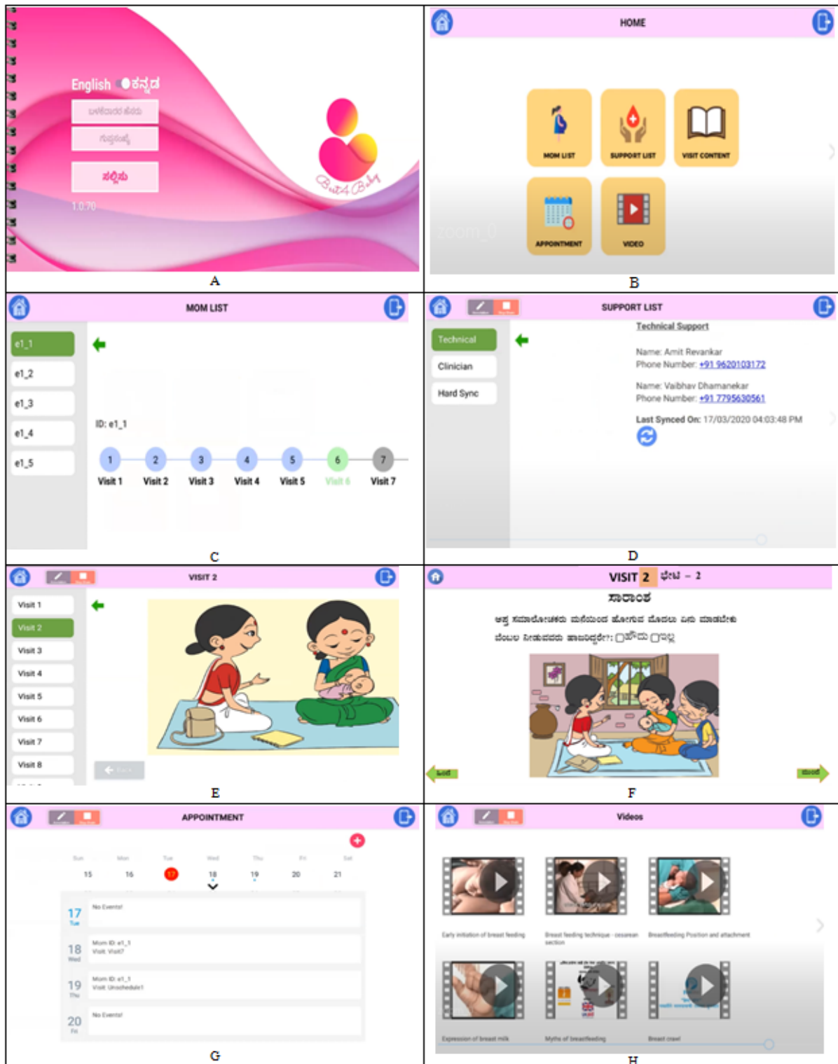
Figure 2. Screenshots of the Breastfeeding Education Support Tool for Baby mobile health app. A. Login screen of the BEST4Baby app B. BEST4Baby Homepage C. App displaying visit numbers and assigned moms D. App displaying support list for technical and clinical support E. App displaying visit content (In English) F. App displaying visit content (In Kannada) G. App displaying appointment calendar H. App displaying educational videos on breastfeeding.