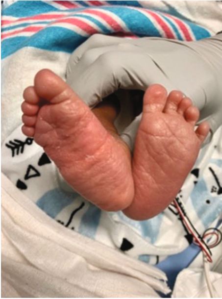
FIGURE 3: This figure depicts the feet of the baby born to patient 3 in this case series. The great toes appear normal. Genetic testing was performed immediately following delivery and revealed absence of the ACVR1/ALK2 gene mutation.

For some but not all patients, pregnancy exacerbates symptoms of FOP. This can result in disease progression and further limitation of mobility due to new-onset ossification. For some, it results in FOP flare-ups which should promptly be treated with corticosteroids. For others, restrictive pulmonary dysfunction may become more pronounced due to pulmonary compression by the increasing intra-abdominal volume and reduced chest wall compliance. It is imperative that an anesthesiologist, pulmonologist, and FOP expert be available for consultation in these scenarios.