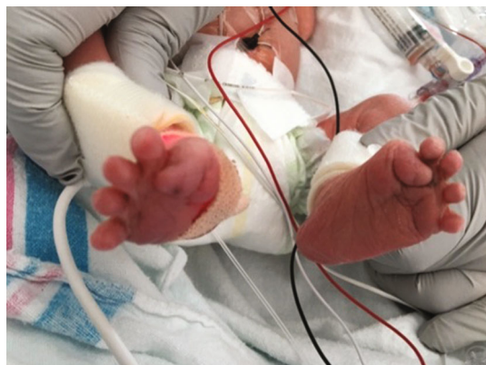
FIGURE 1: This figure depicts the malformed great toes of patient 2's baby. Based on physical exam, there was high clinical suspicion for FOP, and subsequent testing for the ACVR1/ALK2 gene mutation confirmed a diagnosis of classic FOP.