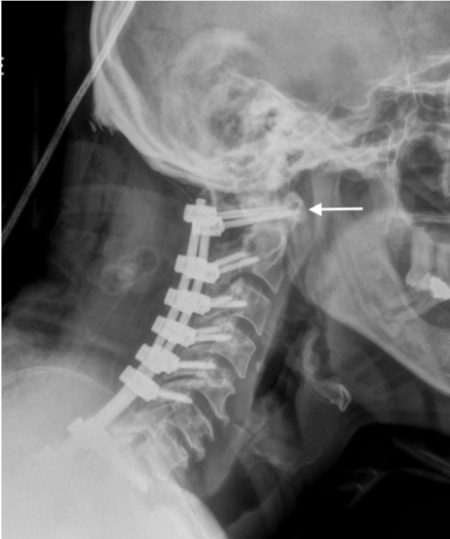
Fig. 4 – Postoperative lateral cervical radiograph following C1 screw replacement (white arrow).

mass, and C1 transverse process) the average diameter of the HN was 2.4 mm (SD 0.5 mm). The HN was located lateral to the C1 lateral mass in 85% of cases and in front of the lateral half of the lateral mass in 15% of cases. The ICA was located lateral to the C1 lateral mass in 44.4% of cases and in front of the lateral half of the lateral mass in 55.6% of cases. There was a statistically significant correlation between HN and ICA in terms of the distance from the midline, C1 lateral mass and transverse process. Consequently, medially located ICA was demonstrated to be a risk factor for HN located ventral to the lateral half of the C1 lateral mass.