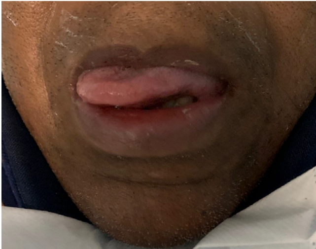
Fig. 2 – Tongue deviation to the right observed on postoperative day 1 (POD1) in a patient with hypoglossal nerve injury.

ities were found. Computer tomography angiography (CTA) of his head and neck did not demonstrate any vascular occlusion. MRI of the brain without contrast revealed no evidence of acute infarct, hemorrhage, or mass effect. On review of the CTA images, the right C1 lateral mass screw was noted to extend 4 mm beyond the anterior cortical margin of the C1 arch (Fig. 3). The hypoglossal palsy was felt to be attributable to direct mechanical compression or injury from the C1 lateral mass screw. Findings were discussed with the patient and a decision was made to proceed with revision of the right C1 screw.