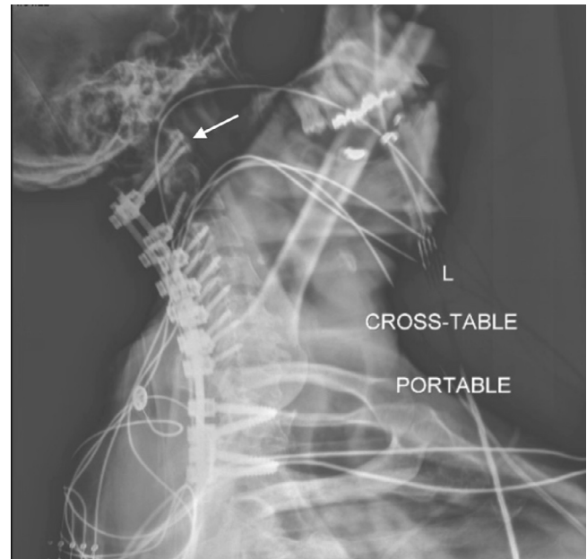
Fig. 1 – Postoperative lateral cervical radiograph, “Swimmer’s view,” depicting placement of the posterior instrumentation from C1-T2. Area of interest at C1 anterior arch (white arrow).

Given the presentation of progressive myelopathy that was felt to be secondary to spinal cord compression from the odontoid process fracture and subaxial central canal stenosis, the decision was made to proceed with posterior decompression and instrumented fusion. The patient was brought to the operating room electively for a C1-T2 posterior cervical decompression and instrumented fusion with autograft placement (Fig. 1). Patient was intubated under direct visualization with video laryngoscopy. Neurophysiologic monitoring with motor evoked potentials (MEPs), somatosensory evoked potentials (SSEPs), free running electromyography (EMG), and brainstem auditory evoked responses (BAERs), and electroencephalography (EEG) was performed throughout the case, beginning