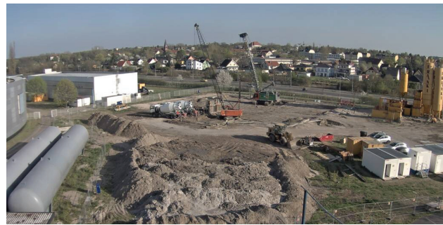
Figure 4: bERLinPro construction.

until September 2014. All required licenses as approval notice (funding by BMBF), building and radiation protection permission and a lot of more licenses in connection to responsible authorities are present. After some rearrangement of rooms inside the halls, caused by switch of the two hall positions, all planning phases are finished now.