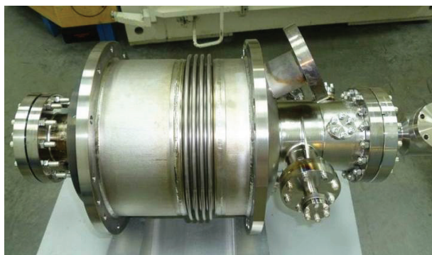
Figure 3: The SRF photoinjector cavity in its Ti vessel.

The first suitable photoinjector gun for bERLinPro (Gun 1.0) has been fabricated by Jefferson Lab last year [4]. Following the fabrication at JLab, the cavity was processed and tested a number of times. In spite of a vertical test performance, less than desired, the titanium helium vessel was electron beam welded to the cavity. A photograph of the