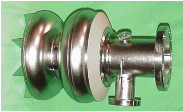
Figure 2: The Pb coated gun cavity.

an average current below 1 mA. This gun contains a 1.6 cell 1.3 GHz SRF gun cavity. The back wall has a small area coated with Pb used as the photocathode (see Figure 2).