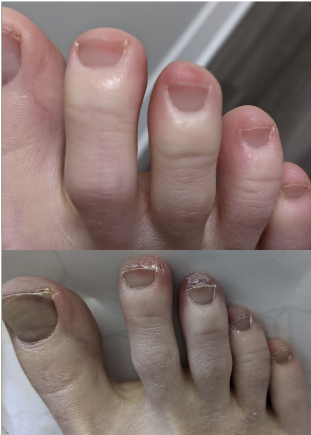
Figure 4. Patient 2—COVID toes at 9 months (top) and 11 months (bottom) after symptom onset.

One month after onset of symptoms, the patient developed tachycardia, “COVID-19 toes” (Figure 4), significant postexertion fatigue, joint pain, insomnia, intermittent anosmia and dysgeusia,