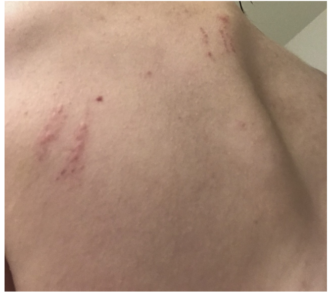
Figure 2. Patient 1—Rash on left upper back and 3 linear rashes on upper back on the spine.

Six months after the initial infection (June 2020), the patient ate cheese, to which she has a known allergy. She therefore self-administered an over-the-counter oral histamine antagonist, diphenhydramine HCl 50 mg. The following morning, she noted considerable relief of fatigue and improved ability to concentrate.