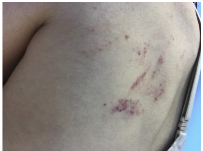
Figure 3. Patient 1—Rash on left scapula.

She did not take additional histamine antagonists for the next 72 hours, during which time she experienced a recurrence of the fatigue and cognitive symptoms. The patient again self-administered diphenhydramine, and observed an improvement in symptoms. After 6 months of daily self-administration of diphenhydramine HCl 50 mg, the patient was prescribed hydroxyzine pamoate 25 mg and instructed to titrate the dose not to exceed 150 mg/d, until relief of symptoms occurred. At 25 mg daily, she experienced partial symptom resolution with decreased rashes and bruising, improved cognition, and reduced fatigue. On follow-up, the pulmonologist also noted these effects.