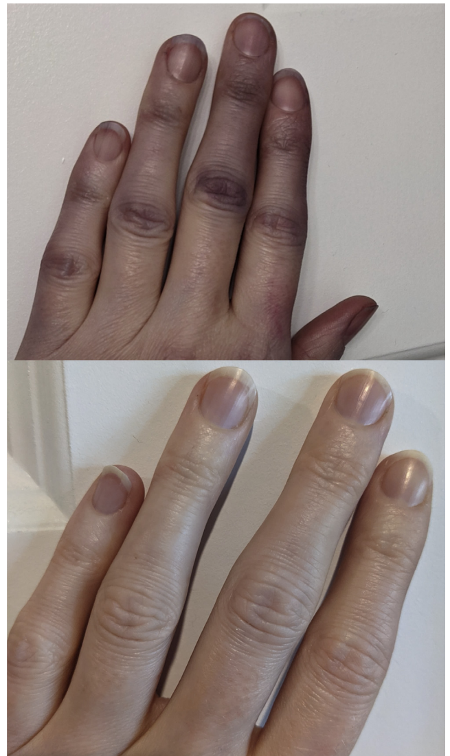
Figure 5. Patient 2—Bilateral acrocyanosis of the hands, from the proximal interphalangeal joint extending to the fingertips, of 9 months (top) after onset of symptoms and after resolution (bottom).

Thirteen months after the onset of acute COVID-19 infection, the patient substituted 25 mg diphenhydramine HCl for the fexofenadine as she had run out of the latter. She did not seek guidance for this medication change using an online source. The following morning, she noted resolution of brain fog and fatigue. She therefore continued the diphenhydramine daily, whereupon she noted marked improvement in brain fog, fatigue, and abdominal pain, and