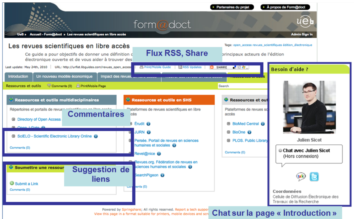
Interaction with a Form@doct guide

Finally, an evaluation questionnaire was developed on Form@doct itself, designed to obtain feedback on content, learning methods and services available. However, other methods of monitoring and interaction still need to be found to strengthen the relationship with PhD students and develop a regular and sustainable use of the tutorial.