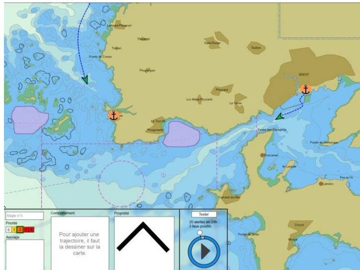
Fig. 3. Create a new rule in Hyperion platform.

In the rule box, each part of the rule is visible. First, the text area in the top left corner allows the showing and editing of the rule name. First, a default name “rule n°--” is given to the rule. Below, the slider corresponds to the rule priority that allows the user to order alert treatment by setting the colors and the numbers to the Vigipirate code (a French alert state). The anchorage area shows the “anchorage” property of the rule. The box in the middle (“behavior”) shows the abnormal trajectory expressed by the rule. These two properties are expressed using analog gestures performed directly on the map. Finally, the last box shows the static rule properties. For example, if we want to express a rule forbidding a military ship to enter an area, we have to add the military property. The static property set can be accessed by performing an up swipe on the property box.