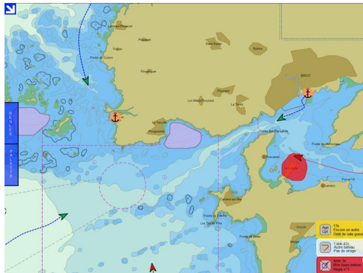
Fig. 2. Hyperion GUI in operational mode.

When an alert occurs, an alert box which give an overview of the alert goes down from top to bottom right of the screen while, an animation catches the operator attention on the boat triggering the alert. Until alert is treated, the alert box stays in the stack of alerts. Alert box presents the icon of the rule, the time since the alert, the boat name, the rule name, and a number and a color that corresponds to the rule priority. If a vessel breaks a rule, it takes the color of the rule priority or a color corresponding to the sum of broken rules priorities, if more than one rule is broken.