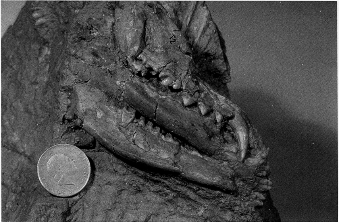
Plioviverrops faventinus TORRE 1988 dai riempimenti fine-messiniani delle fessure carsiche di Cava dei Gessi del Monticino (Brisighella). Museo Civico di Scienze Naturali "Malmerendi", Faenza