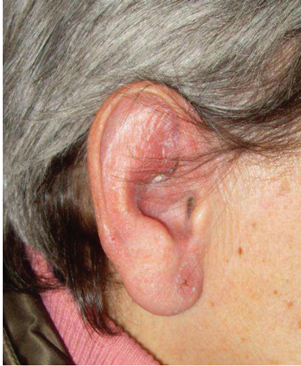
FIGURE 3: Swelling with features of chondritis and crusted lesions in the right ear.