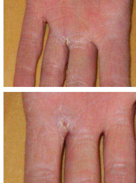
FIGURE 5: Vasculitic-like ulcerative lesions of the hands (palm).

Cat scratch disease caused by B. henselae is a relatively common and ubiquitous infectious disease, which has been recognized as one of the common causes of regional lymphadenopathy with an expanding spectrum of clinical manifestations. Detection and isolation of Bartonella species from arthropods, pets (usually cats but dogs too) and small wild animals is commonplace; this includes a variety of known