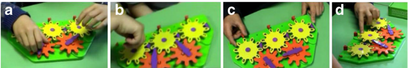
Figure 2. Usage and deictic gestures (Exp_A)

The students also found that the movement of the wheel is not continuous but jerky and the movements of the wheels were linked together. In general, other static artefact components (as the red triangles and the point) were detected later, as well as the sound.