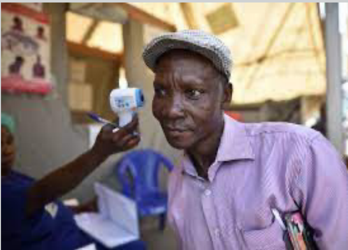
A man willingly adheres to COVID-19 protocols

While CSOs' contributions to the development of Ghana is well documented in the literature, they tend to focus primarily on their engagement in the democratization processes and poverty reduction 6 . Thus, existing analysis of civil society's contributions to national development tend to be sector-specific and therefore fail to present a comprehensive understanding of their roles and contributions to the development of the country. More importantly, given the recent COVID-19 pandemic, CSOs have been very instrumental in the fight against the pandemic through their engagements in advocacy, awareness creation, service provision and resource mobilisation. They have also taken a front role by collaborating with the government and private sector to curtail the spread of COVID-19 and have been instrumental in efforts towards post COVID-19 recovery 7 .