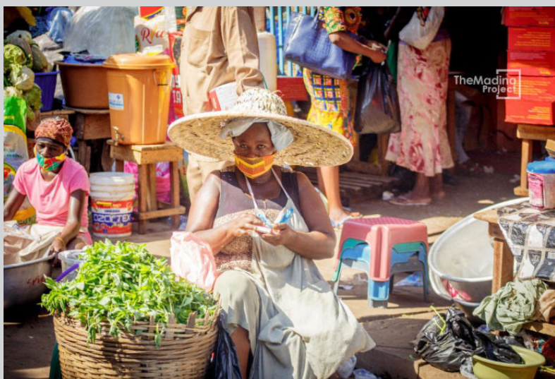
Vegetable vendors at Madina Market in Accra, Ghana observe COVID-19 safety practices and social distancing

Another important role played by CSOs relates to creating awareness on the COVID-19 responses by the government. Interviewees explained that given the politicised nature of government interventions in Ghana, CSOs provided objective and alternative source of information on programmes such as the COVID-19 Alleviation Programme to their intended beneficiaries.