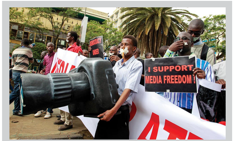
Journalist protest against proposed media Bill