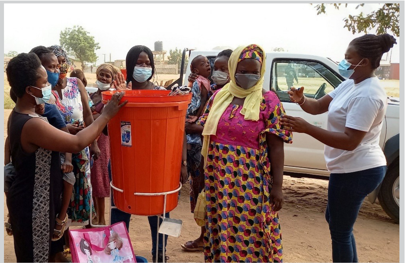
A self-help group being presented with a Veronica bucket for handwashing during the peak of COVID-19 pandemic

Over the years, CSOs in Ghana have played significant roles towards the country's development. While the contributions of CSOs to national development is varied, the discussion in this report focuses particularly on three main areas: i) good governance and democratic processes; ii) complementary roles in service delivery; and iii) engagements in advocacy and policy influencing. These contributions of CSOs to national development are discussed in detail below.