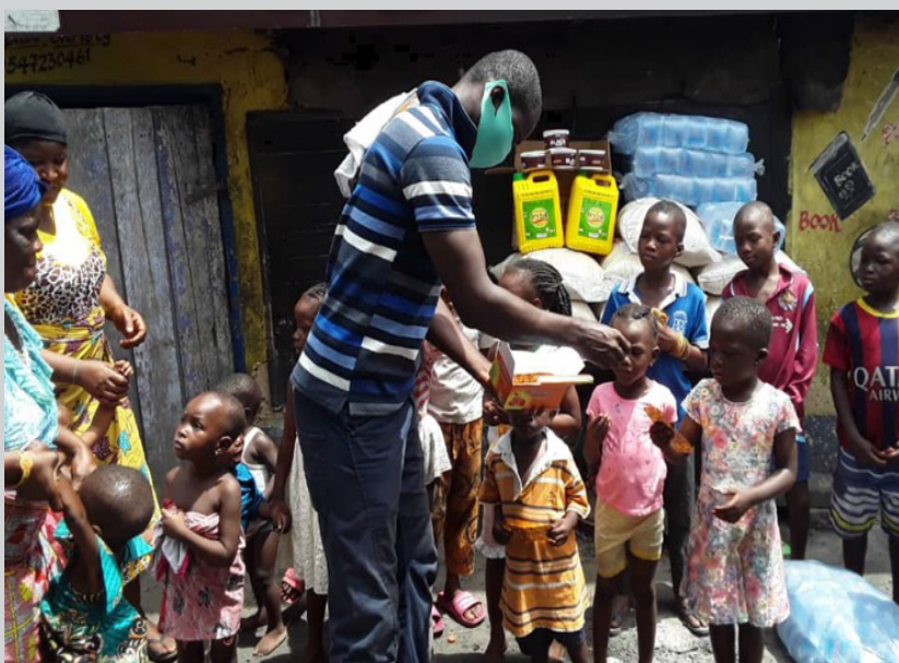
COVID-19 relief items distributed to vulnerable children

Our interview data suggests that despite the challenges associated civil society's involvement in development such as limited extent of the impact of their development interventions on the lives of intended beneficiaries, they contribute significantly towards Ghana's development in terms of service delivery by supporting the needy and vulnerable in society. Speaking about the contributions of civil society to Ghana's social development, an interviewee had this to say: