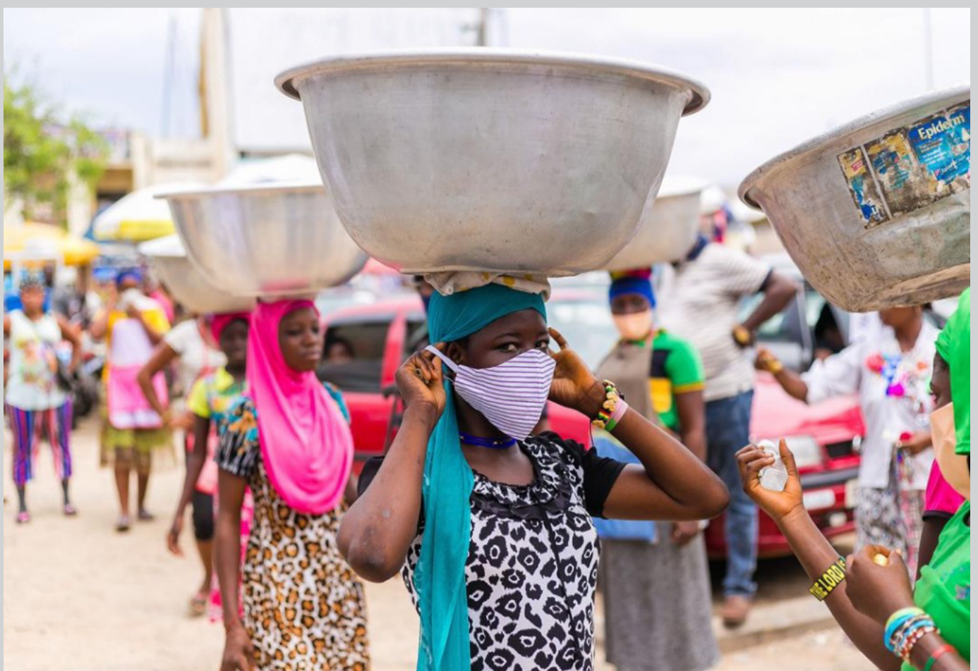
Weinglo Family International donate 1000 nose masks to Kayayei (Head Potters) in Accra

One of such actions has been made possible through an IMANI Africa and Deutsche Gesellschaft für Internationale Zusammenarbeit GmbH (GIZ) partnership to carry out six (6) reform dialogues in the country. The first of the policy dialogue which was held in November 2020 explored challenges and opportunities created by the COVID-19 pandemic for Ghanaian businesses and the second (in March 2021) focused on what the African Continental Free Trade Area (AfCFTA) meant for COVID-stricken Ghanaian businesses. The dialogues which started in November 2020, saw its third session on 12th May 2021 in Accra on the theme "Business Taxation and the Road to Ghana's Post-COVID Economic Recovery." IMANI Africa managed to assemble some of Ghana's finest economic minds from academia, politics, private sector organisations and civil society to discuss the role and effects of taxation in Ghana's post-COVID-19 economic recovery strategy. The discussions focused on ways of exploring business registration and regulation concerns, electricity supply, and the effects of corruption the business climate all in a bit to having a resilient economic climate post-COVID-19.