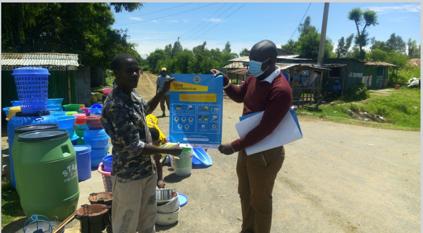
Civil society advocates travel throughout districts to conduct community mobilisation and awareness on COVID-19

“At the national level, CSOs have generated evidence that have been used in influencing policies and practices. We can talk about CDD-Ghana’s, IDEG’s, IMANI’s etc. who have generated evidence that they have used in influencing specific government policies and legislations. We have seen CSOs providing technical assistance to government in the crafting of legislations and technical papers as the Affirmative Action, Private Members Act, Domestic Violence, Non-profit Organisations Policy etc. In that sense, they have provided technical expertise to support government and they also advocate for the passage and implementation of laws and policies” (Interview, Key Informant, 16th June 2021)”.