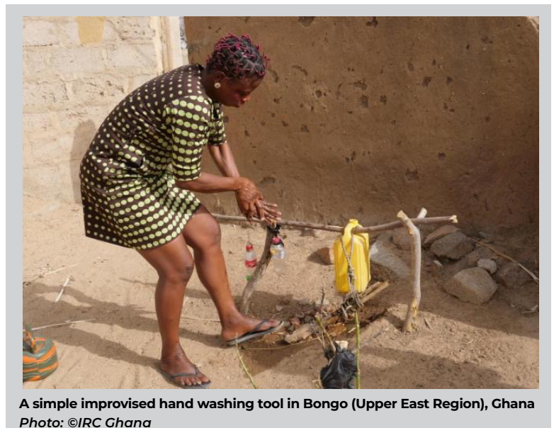
A simple improvised hand washing tool in Bongo (Upper East Region), Ghana

These measures included social (physical) distancing, the wearing of facemasks, restriction on movements in the form of partial and full lockdowns and ban on many social events and gatherings in the country. These according to reports distorted the activities of many organisations and CSOs particularly at the programme implementation stages 64 . That notwithstanding, they ensured that they played their traditional roles with added value.