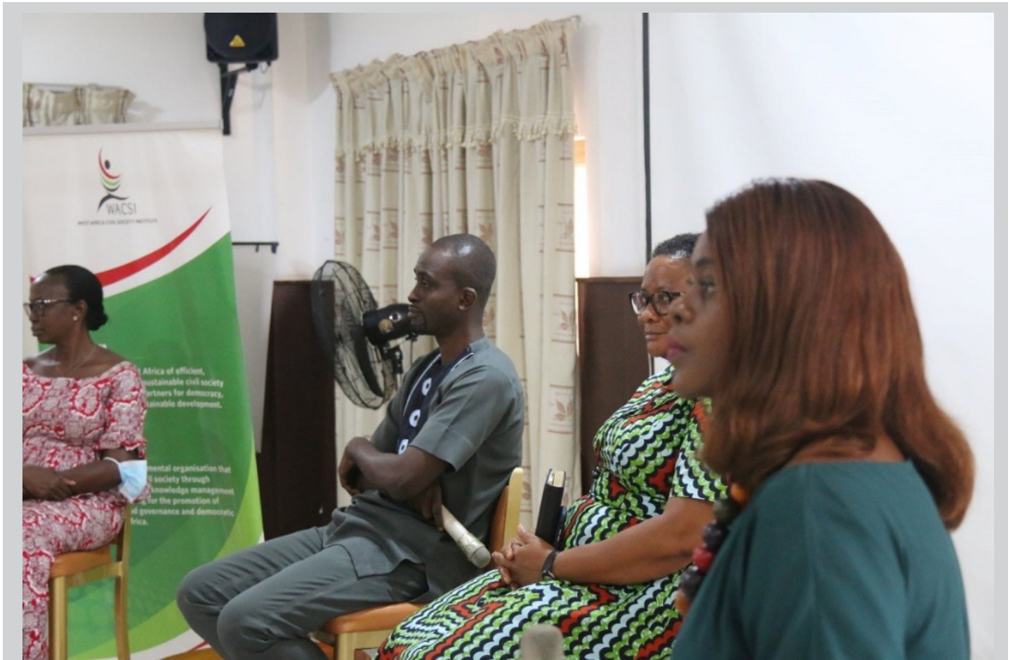
CSO key actors discuss COVID-19 and recovery efforts during WACSI's 'Rebuilding for Good' convening