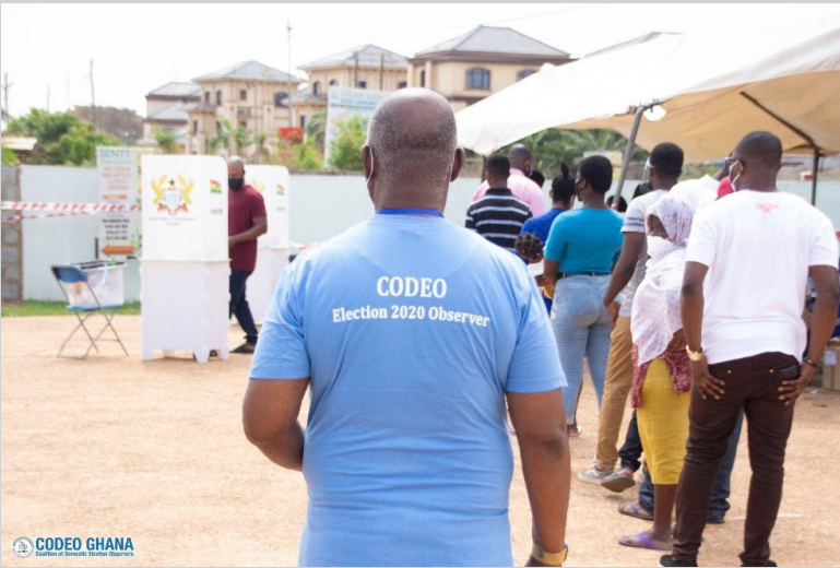
Ongoing Ghana 2020 polls with CODEO official observing

Another important role played by CSOs in consolidating Ghana's democracy relates to their 'watchdog' functions around elections, anti-corruption and policy implementation. By doing so, they ensure accountability and transparency on the part of government officials. Specifically in the area of elections, CSOs such as Coalition of Domestic Election Observers (CODEO)...have been consistent in monitoring elections in Ghana over the years