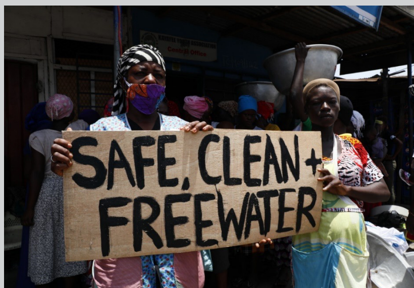
Kayayei (Head porters) gather to protest government failure to provide relief packages amid COVID-19

Against this backdrop, this report analyses the contributions of CSOs to Ghana's development and their engagement in COVID-19 responses and post-pandemic recovery. It also explores the potential barriers that seek to hinder the CSOs' contributions to national development. The report is guided by the following questions: What has been the roles and contributions of CSOs Ghana's national development over the years? How has CSOs contributed to COVID-19 responses and what should be their roles in promoting a desired COVID-19 future in Ghana?