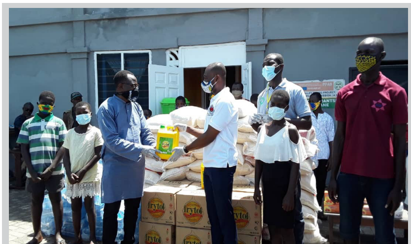
CSOs respond to COVID-19 with relief items for the vulnerable in society