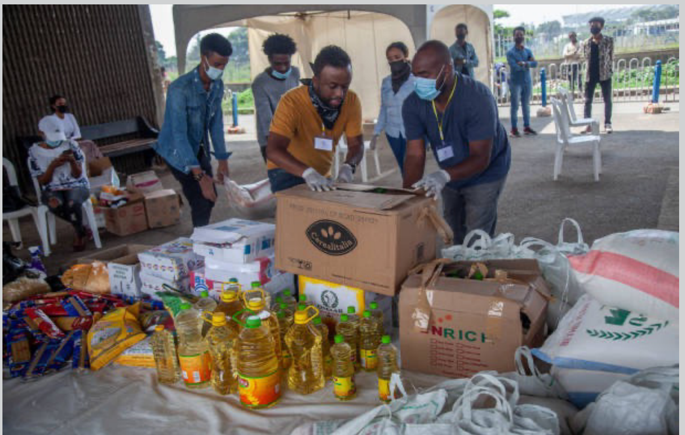
A group of gospel musicians delivering on their initiative dubbed “Sharing food to the needy amid COVID-19”

Having discussed CSOs' contributions to the fight against the COVID-19 pandemic, the next section examines the role of CSOs in post COVID-19 recovery.