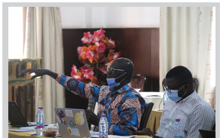
CSO representatives at WACSI's 'Rebuilding for Good' convening contribute to discussion on COVID-19 recovery efforts and the role of civil society

Despite the significant contributions of CSOs to national development such as their engagement in democratic consolidation, policy advocacy and influencing, service delivery and more recently their responses to COVID-19, concerns were raised by interviewees about potential barriers or limitations that hinder the ability of CSOs to meaningfully undertake their activities as key development stakeholders. While the potential limitations are varied, in this report, we categorized them into access to information, funding challenges, shrinking civic space and apathy of the citizenry towards the work of CSOs. These are discussed below: