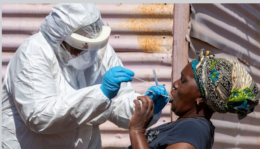
Regular testing as key government response to COVID-19

During interviews, it became clear that CSO representatives were not satisfied with the present nature of relationship between the government and the civil society in general. For many of these key informants, the government appears to collaborate with civil society only to tick its 'governance boxes'. In fact, an interviewee explained that government is superficially engaging with CSOs to meet donor