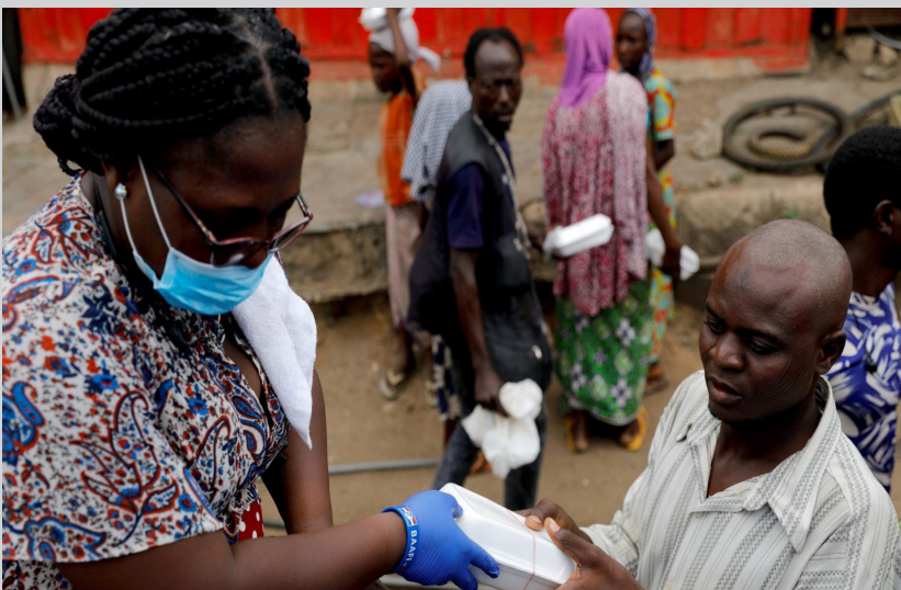
CSO response to COVID-19 and food insecurities in Ghana

and resource mobilisation potential of CSOs. The human resource challenge of Ghanaian CSOs is partly attributed to the project-based nature of funding characterised by short-term funding and the absence of core funding which affect the ability of CSOs to retain their competent staff when project funds end. The resultant effect is high turnover among CSO employees 20 . For instance, recent studies have highlighted how some CSOs in Ghana are unable to give long-term contract to their employees which leads to high job insecurity and attrition in the CSO sector