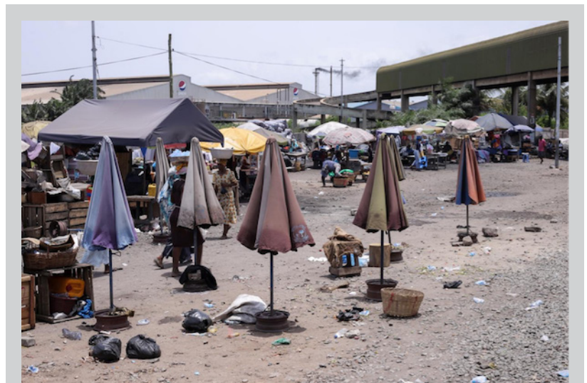
Human impact of COVID-19 lockdown in Ghana markets

Moreover, aid volatility also threatens the strategic planning of CSOs that are highly dependent on external donor funding which in turn affects their overall sustainability. This is largely due to changes in donor funding modalities and priorities. Many donors are now focusing on aid-for-trade as part of their funding priorities. In Ghana, many small and medium-size CSOs depend largely on one source of funding which is mostly external donor funding, hence when there is a change in donor priorities and modalities, it exposes them to financial vulnerability.