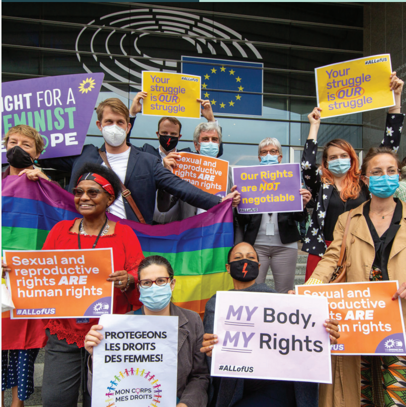
Action in support of SRHR by members of the European Parliament in front of the European Parliament.

We work with a broad group of stakeholders to promote SRHR across the region, and we provided resources and support to members of the European Parliament leading on this initiative. The adopted resolution cites our World Abortion Laws Map in its discussion of laws on abortion globally and in the EU that still fall short and fail to protect reproductive rights.