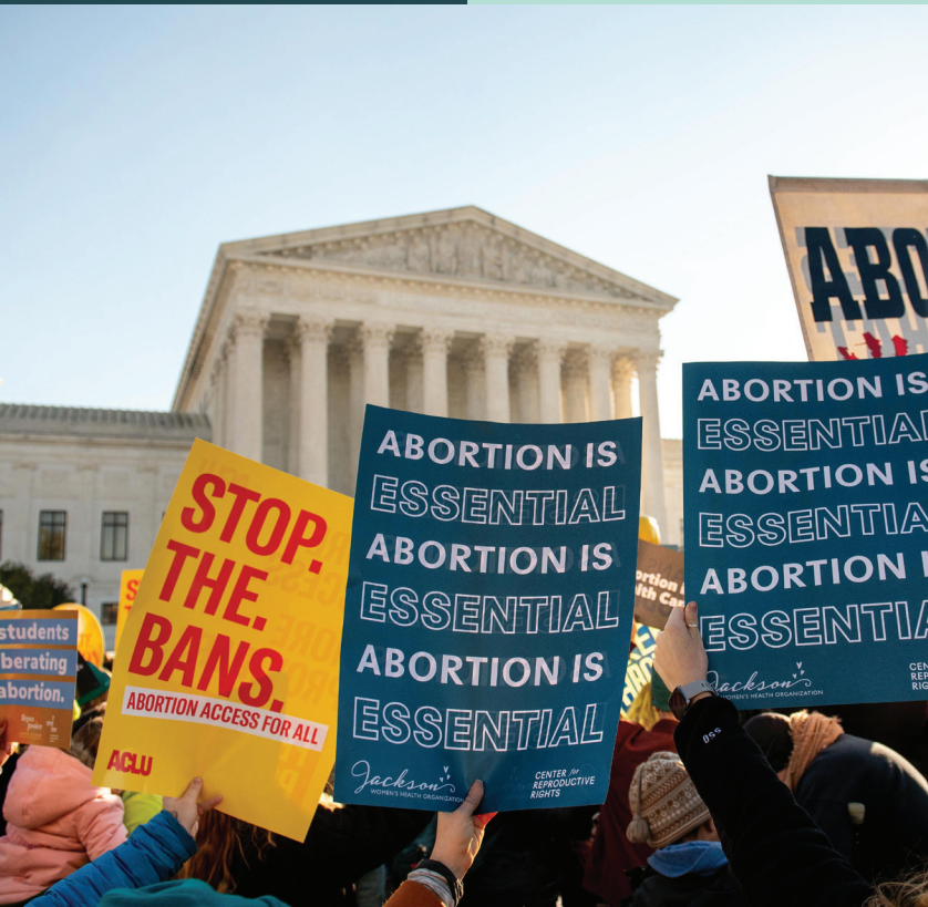
Abortion rights supporters outside the U.S. Supreme Court.

Senior Director of U.S. Litigation, Center for Reproductive Rights, arguing before the U.S. Supreme Court in our Mississippi case, Dobbs v. Jackson Women’s Health Organization