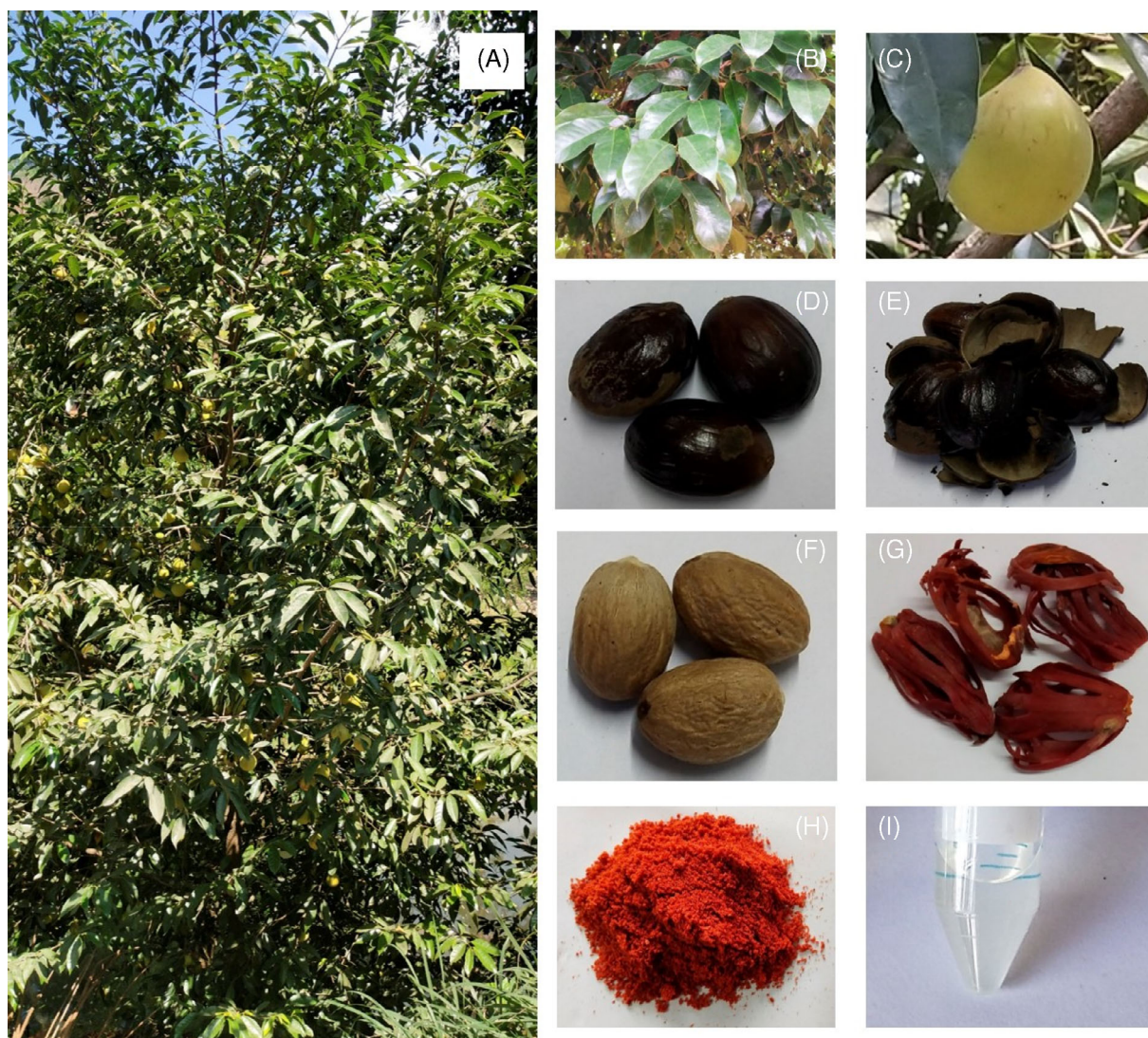
FIGURE 1 Morphological identification of Myristica fragrans Houtt. (a) The young tree; (b) leaves of the plant; (c) fruit; (d) seed; (e) rind; (f) kernel (nutmeg); (g) mace (aril); (h) ground powder of mace; and (i) mace essential oil

Valente et al., 2015). The differences in EO yield of nutmeg might be due to changes in soil type, location, origin, extraction methods, and environmental conditions (Ashokkumar et al., 2022).