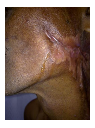
Figure 1: Parotid fistula with watery discharge through previous surgical scar.

months but a small opening persisted in the scar over (L) cheek discharging watery fluid, more so during mastication.