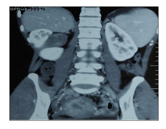
Figure 1: CECT KUB reported localized collection around the upper and midpole of rt kidney with complex cyst/mass in upper pole with no contrast enhancement.

region which spontaneously bursted out and became chronic wound with seropurulent discharge.