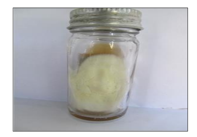
Figure 10: Growth on SDA of Epidermophyton floccosum .

NDM were 100% sensitive to Itraconazole, Nystatin and Amphotericin B. Candida spp. were 100% sensitive to Itraconazole, Fluconazole.