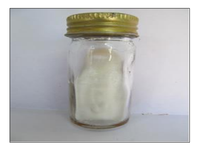
Figure 9: Growth on SDA of Trichophyton mentagrophytes.

Antifungal susceptibility testing: In the present study susceptible as well as intermediate sensitive were taken as sensitive. Most of the trichophyton species were 100% sensitive to Ketoconazole and Clotrimazole.