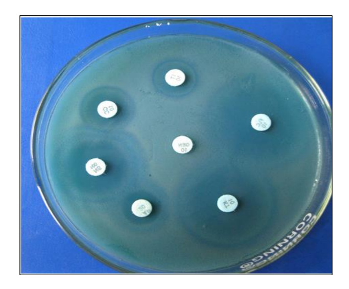
Figure 6: Antifungal susceptibility testing for Candida spp.

For NDM, the fungi were sub cultured on potato dextrose agar one week before to testing and the inoculum suspensions were prepared to optical densities ranged from 0.09 to 0.11. The agar plates were inoculated with inoculum suspension with sterile swab and antifungal disks (HiMedia) were placed (CLSI, M51A) and incubated for 48 hours and observed for zones of inhibition (Figure 7).