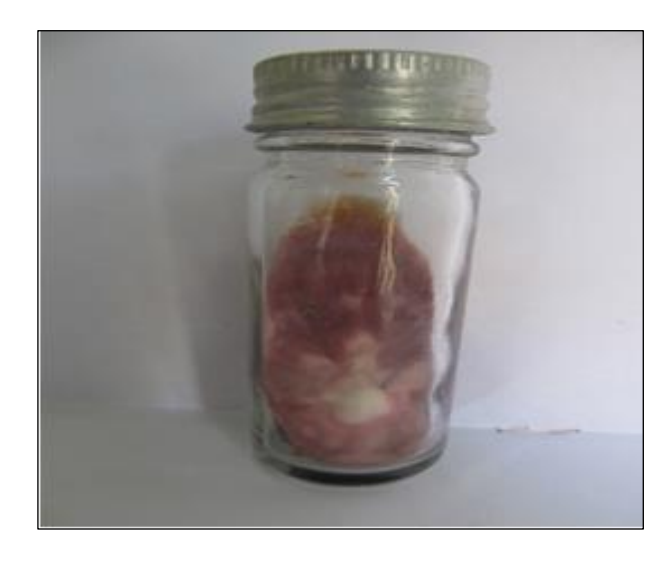
Figure 8: Growth on SDA of Trichophyton rubrum.