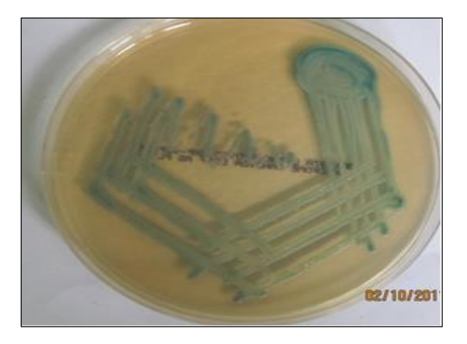
Figure 4: CHROM agar showing colonies of Candida albicans .

For Candida, it recommends the use of Mueller-Hinton agar supplemented with 2% glucose and 0.5 \mu g/ml methylene blue dye medium. Inoculum was prepared from the yeast