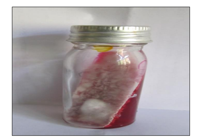
Figure 2: Dermatophyte test medium showing colour change.