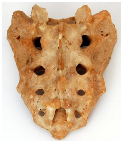
Figure 1: Showing large triangular bone, the sacrum, formed by fusion of five sacral vertebrae. Sacral canal completely formed posteriorly by fusion of upper four sacral laminae. The fifth sacral lamina is deficient in the midline posteriorly resulting in sacral hiatus.

represented in the spine. Embryologically, a detailed cascade of events must occur to result in the proper formation of both the musculoskeletal and neural elements of the spine.