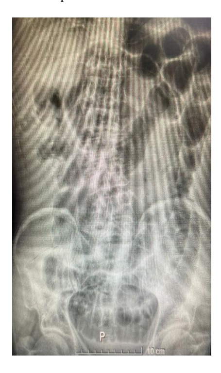
Figure 1: Abdomen X-ray with dilation of the cecum and displacement of the contralateral small bowel, multiple air-fluid levels and no visible rectal ampulla.

The patient had a successful postoperative evolution, tolerating oral administration and bowel movements. Therefore, discharge on the 5th postoperative day and outpatient follow-up were decided.