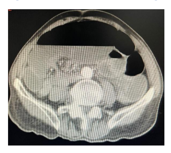
Figure 2: CT scan of the abdomen with intravenous contrast with significant dilation of the cecum, twisting off its mesenteric axis, and dilation of the small bowel.