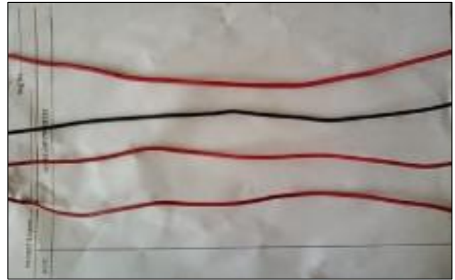
Figure 1: The electric cables.

The authors developed a non-destructive technique of entrapped ring removal utilizing 1.5-2.5mm electric cables (Curtix Plc, Nnewi, Nigeria) (Figure 1). Figure 2 shows an entrapped ring in the right thumb.