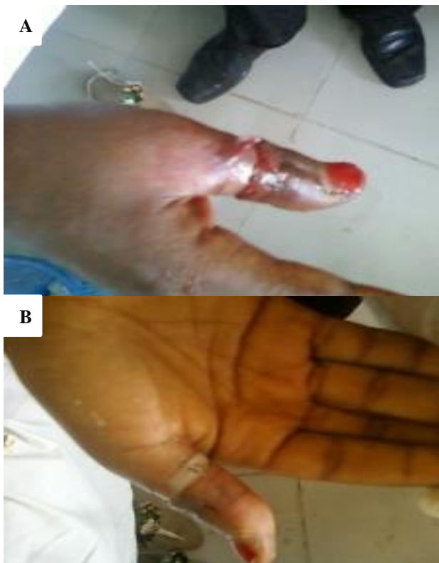
Figure 4: A): The finger after ring removal; dorsal surface, B): The finger after ring removal palmar surface.

The electric cables are sterilized with methylated spirit. After skin preparation, a digital block with lignocaine without adrenaline (1%) is given to the affected finger. The patient is also sedated with injection diazepam. A petroleum jelly lubricant is copiously applied to the finger. Three or four electric cables, depending on the number that can conveniently be contained, are passed under the ring from the palmar surface and looped over the ring (Figures 3 A,B,C) and secured at the sides of both the palmar and dorsal surfaces of the finger. Note that only two of the originally three cables remained at the end of the procedure. The surgeon holds two of the looped cables while his first assistant holds one or two depending on how many cables could be passed under the ring.