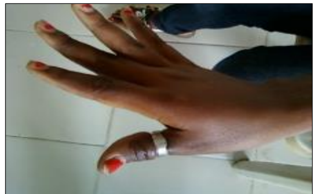
Figure 2: Entrapped finger ring in the right thumb of a patient.