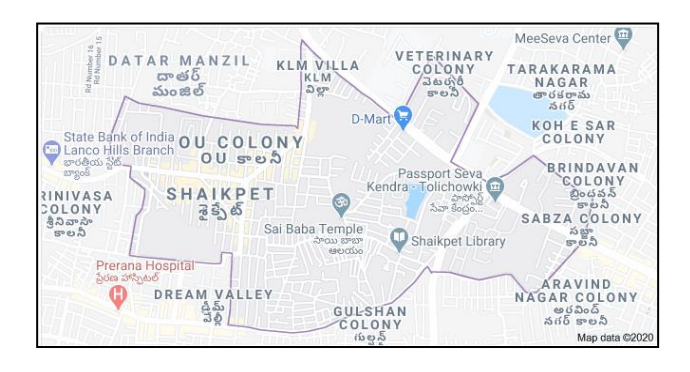
Figure 1: Map of the Shaikpet area, Hyderabad.

A community based cross sectional study was conducted. The duration of study was 3 months. Study population included residents of urban slum area of Shaikpet in the age groups between 18-60 years and residing in the area for more than 6 months and willing to participate were included in the study. All people with severe illness and mentally unfit to comprehend the questions were excluded. Informed written consent was taken prior to administering the questionnaire and ethical clearance has been taken before the study from Human Ethics Committee.