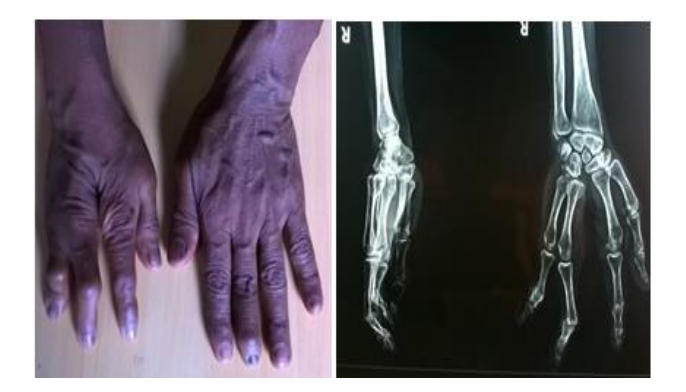
Figure 1: Unilateral involvement with isolated absence of third digital ray (case-1) with a V-shaped cleft.

On right side he had a cleft hand with absence of central digital ray and also had bony fusion of first and second metacarpal (syndactyly) along with variable fusion of carpals, had a good grip with right hand. On left side he had only first digital ray with scaphoid and trapezium and absence of rest of the elements. The daughter of the affected mother (case-3) had affected right hand with absence of phalanges of third digit and bony fusion of first and second ray. The cleft deformity was U shaped, she had good grip. The grandson of the affected mother (case-4) had right lower limb involvement instead as cleft foot with absence of second and third digit and absence of some corresponding tarsal. He also had tibial hemimelia on same side and having difficulty in walking.