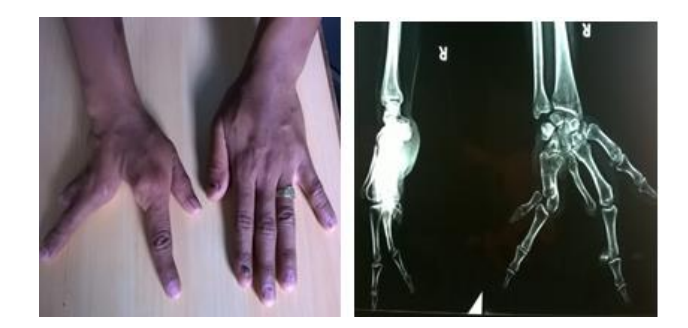
Figure 3: The daughter of the affected mother (case-3) had affected right hand with absence of phalanges of third digit and bony fusion of first and second ray.