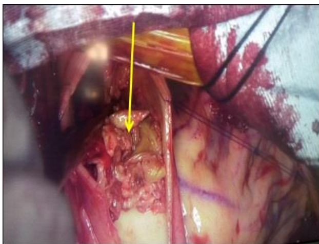
Figure 2: Pulmonary embolus in pulmonary artery (yellow arrow).

Post procedure BP and PA pressure were 124/42 mmHg and 64/16 mmHg respectively, with inotropic supports. Patient developed reperfusion pulmonary edema on 2 nd postoperative day (Figure 3) in intensive care unit (ICU),