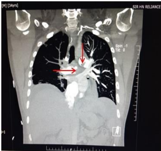
Figure 1: CTPA of embolus in right and left pulmonary artery (red arrows).

rocuronium as a muscle relaxant. Isoflurane was used as maintenance with 50% oxygen in air along with midazolam, fentanyl and atracurium. Transesophageal echocardiography (TEE) probe guided after induction and Swan-Ganz catheter inserted after median sternotomy. Post induction blood pressure (BP) and pulmonary artery pressure (PAP) were 97/50 mmHg and 153/43 mmHg respectively. Nitric oxide (NO) at 20 ppm via inhalation and milrinone were started to neutralize the rise of pulmonary pressure. After cardio pulmonary bypass (CPB) and with 4 cycle of total cardiac arrest (TCA), pulmonary arteries were dissected and endarterectomy performed (Figure 2).