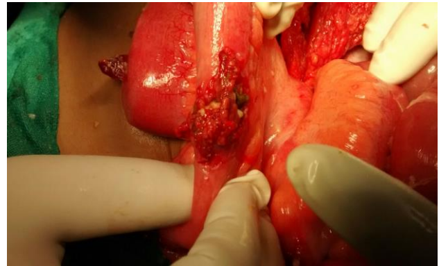
Figure 1: Intraoperative finding of tubercular ileal perforation.

lady. The mean age of our study group was 28.7 years. According to the WHO BMI classification, 70% of our patients were found to be in the underweight category and 30% were in the normal category. Forty three (56.6%) presented to the hospital with features suggestive of peritonitis and thirty-three (43.4) were suffering from acute intestinal obstruction.