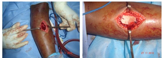
Figure 3: a) Intraoperative picture showing a large cortical window. b) The defect was filled with allograft.

crest graft) from screened mother which was harvested in an adjacent operation theatre (Figure 3b). To confirm the diagnosis curetted material was sent for histological examination. On microscopy the section shows a portion of fibro-osseous lesion composed of spindle cell stroma interspersed by spicules of mineralised bone (Figure 4). The limb was protected with a plaster splint for a period of 3 months. The graft gradually consolidated and new bone formation was apparent by 6 months. Remodelling of the medullary canal occurred at 1 year follow up. Child has been followed up to 3 years (till date) and there is no evidence of recurrence (Figure 5). The case illustrates that osteofibrous dysplasia can be effectively treated by curettage and replacement of defect by allograft from parents.