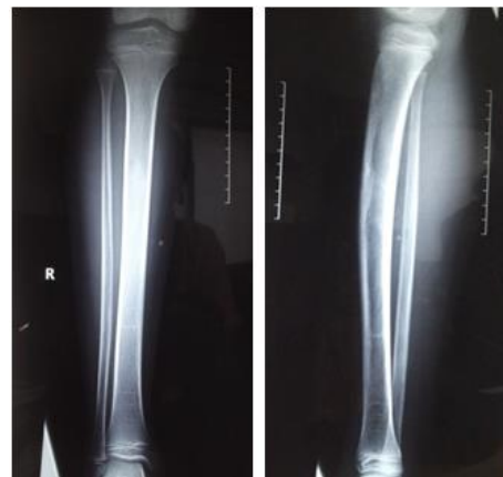
Figure 5: Postop x-ray at 3 years follow up.