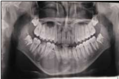
Figure 2: Orthopantomogram.