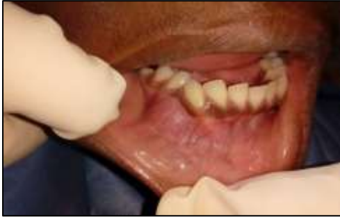
Figure 1: Swelling right mandible.

Gross examination of the specimen showed multiple tissue fragments together measuring 5x4.5x1.5 cm. Cut section was light brown with whitish specks. Extracted tooth also was present along with this.