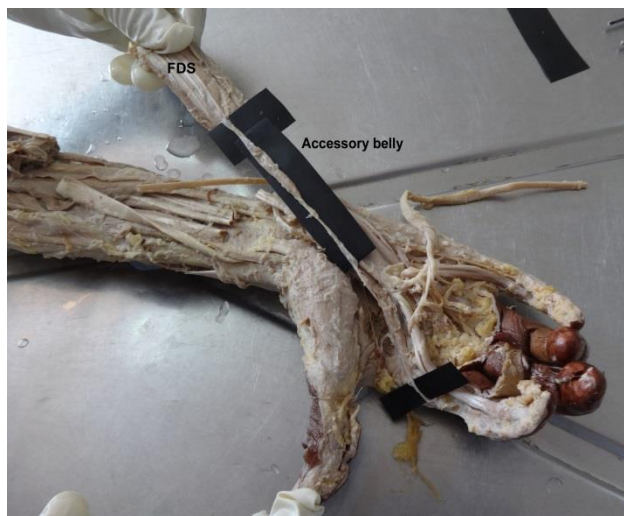
Figure 1: Accessory belly on the undersurface of Flexor Digitorum Superficialis.

joint. A separate nerve supply to the accessory belly could not be found.