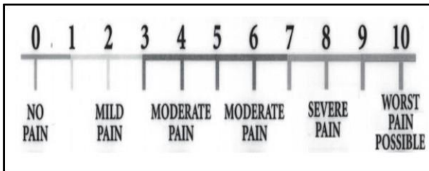
Figure 1: VAS score.

Pain score, sedation and vitals were observed at 2hrs, 4hrs, 8hrs, 16hrs, 24hrs on first postoperative day and 8