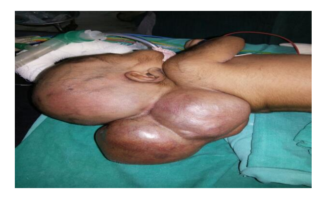
Figure 4: After intubation.

further monitoring. Post operatively, child was observed for respiratory complications.