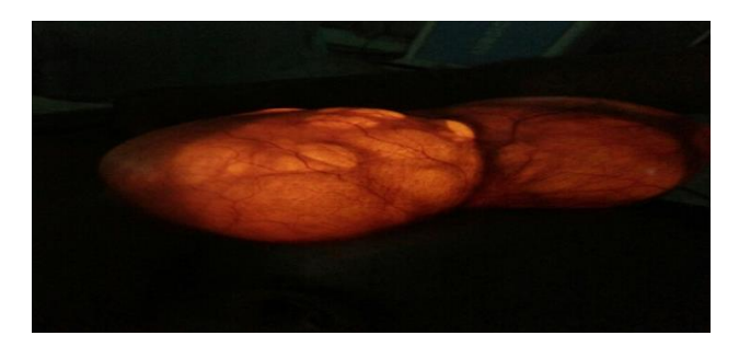
Figure 2: Transillumination test.

The infant used to lie in lateral position, because of the swelling. Neck remains in flexion and extension is not possible in supine position. No facial, maxillary and mandibular defects were present. No other congenital anomaly was present. Weight of infant was 5.9 kg.