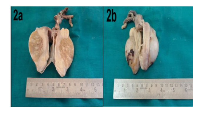
Figure 2:(a) Cut- surface of multiple areas of necrosis involving the testicular tissue and epididymis. (B): External surface of hydrocele sac with fungating necrotic areas.

given anti- tubercular treatment for 6 months. The postoperative recovery of patient was uneventful.