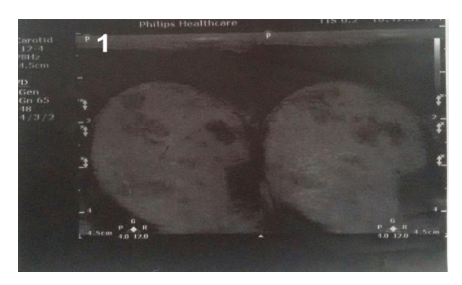
Figure 1: USG revealed enlarged left testis with multiple poorly circumscribed hypoechoic areas with increased vascularity.

and spermatic cord was palpable. The inguinal lymph nodes were not palpable. Prostate was found normal on per rectal examination. Ultrasonography findings revealed enlarged left testis with multiple poorly circumscribed hypoechoic areas with increased vascularity (Figure 1).