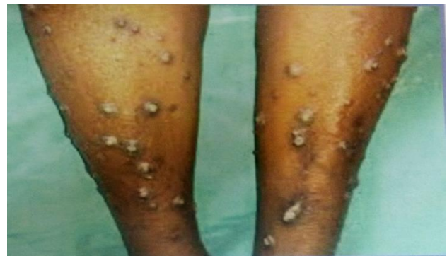
Figure 3: Perforating disorder.

None of the patient were positive for hepatitis and human immunodeficiency virus. Dermatologic examination revealed that 96% patients suffered from at least one type of cutaneous manifestation. Out of 80 patients, the most common cutaneous manifestation in our study was xerosis (66.2%) (Figure 1), followed by pallor (57.5%), pruritus (51.25%), infections (33.75%), AV shunt dermatitis (16.25%), pigmentary changes (13.75%) (Figure 2), purpura and ecchymoses (8.75%) and perforating disorders (2.5%) (Figure 3, Table 2).