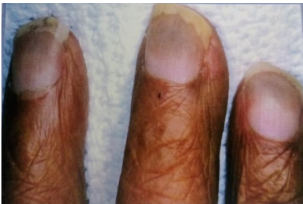
Figure 5: Half and half nail.

Cutaneous manifestations were varying with the severity of CKD, age of the patients and total number of sittings of dialysis (Table 4-6). Severity of pruritus was more in patients with dialysis sitting less than 50 (23.75%) as compared to patients with dialysis sitting more than 100, pruritus decreased to (12.5%).