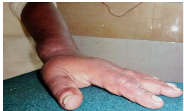
Figure 6: Digit gigantism secondary to AV fistula.

Some rare manifestations of CKD like acquired perforating dermatosis is seen in 2.5% of patients. Biopsies from lesional skin in patients with CKD with perforating dermatosis showed broad crater in epidermis with degenerated collagen in dermis with trans epidermal elimination (Figure 1). One unique finding of present study was digit gigantism secondary to AV fistula seen in two patients, which is the rarest of the rare finding (Figure 6).