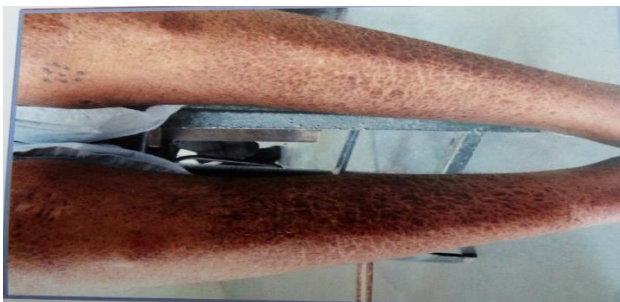
Figure 1: Xerosis over lower extremities.