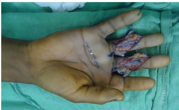
Figure 3: Stage I tendon reconstruction in progress with silicone tubes in situ.