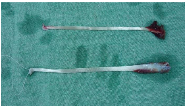
Figure 4: Palmaris longus tendon grafts harvested during second stage tendon reconstruction.

Infection was observed in two patients after stage I surgery. In one patient Staphylococcus aureus was