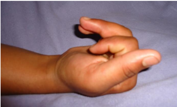
Figure 2: Middle and Ring fingers out of flexion cascade.