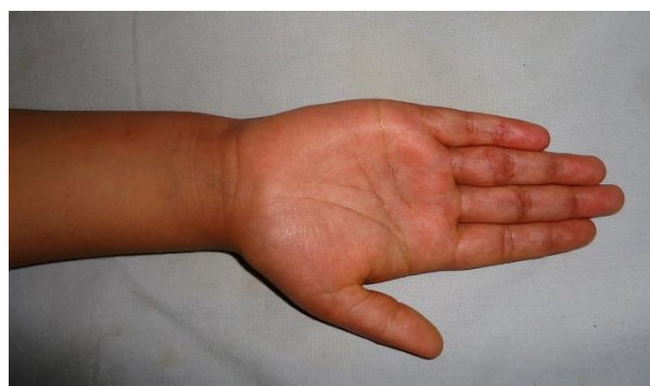
Figure 1: Post tin cut injury scars over volar aspect of PIP joint and proximal phalanges of right middle and ring fingers.

Patients were followed on an average for one and a half year (ranging from 6 to 24 months). The results were measured six months after the stage II surgery. No patient with <6 months of follow-up was included in the study. Assessment of our cases was made based on the total active motion system of evaluation. 13