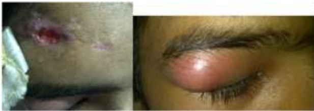
Figure 1: Open infected wound on right side of forehead (above) & Localized swelling of right upper lid.

eriksoni, but based on clinical grounds, we considered this lid abscess to be actinomycotic and Modified Welsh's Regime was started as patient was allergic to Penicillin. This regime consisted of injection Amikacin IV 500 mg (morning) and 250 mg (evening), Tab Co-trimoxazole twice daily, and Tab Rifampicin 600mg once daily before breakfast for twenty one days. The lesion regressed dramatically on subsequent follow ups (Figure 3). An audiometry was done at the end of twenty one days to rule out ototoxicity. Two weeks wash out period was given for Amikacin, after which another cycle of twenty one days was given. Maintenance therapy consisted of Oral Co-trimoxazole and Rifampicin for three months. At five month follow up, the forehead and eyelid lesions had completely healed with no recurrence (Figure 4).