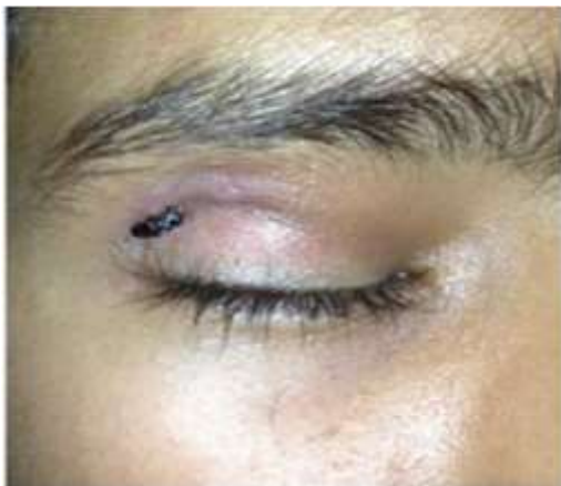
Figure 3: Dramatic regression of lesion on subsequent follow up.