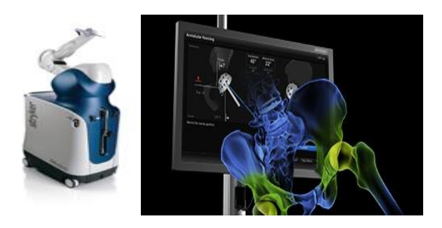
Figure 1: Mako robotic arm which is used in hip surgery.

Hip: It is now possible to plan accurate placement of both the acetabular and femoral components and one that could match to a pre-operative template. A typical