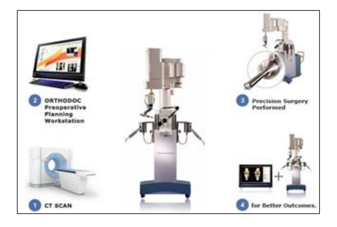
Figure 2: ROBODOC pre-operative planning.

Studies considering improved femoral and acetabular milling have been conducted. Domb et al published better radiographic cup positioning in the safe zones as describe ed by Lewinnek and Callnan, as opposed to 80-62% in the conventional group.<sup>6</sup> It is however, difficult to interpret these accuracies as far as the clinical outcomes are measured.