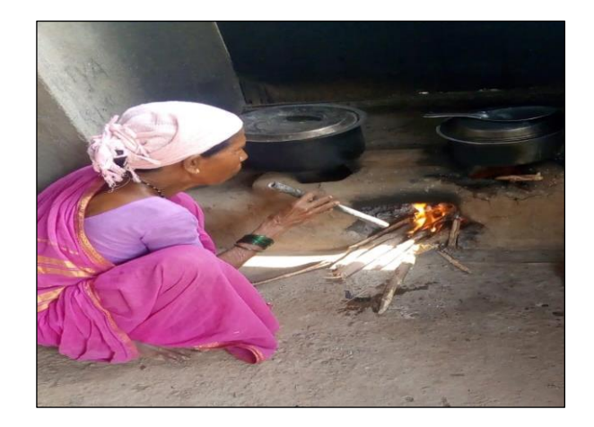
Figure 1: A woman cooking food in fire mud stove with wood as fuel (original).

None of the women were smokers but, 12% of them gave history of smoking by a family member. Most women (76%) cooked thrice daily followed by 23% who cooked four times daily and 1% who cooked more than four times daily. On average, 60% of women spent four or more hours cooking, followed by 23% who spent one to two hours and the rest 17% spent three to four hours cooking. About 9% women reported having slept or have been sleeping in the kitchen.