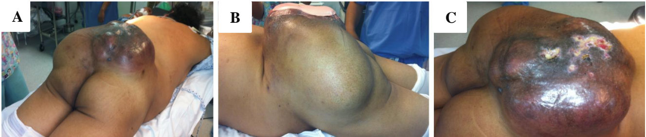
Figure 1: Preoperative clinical photographs. tumor injury of large dimensions in the lumbosacral region, (A) Three-quarter view, skin ulcerations are seen, (B) Side view of the tumor, (C) posterior view.

lumbosacral region of left predominance that exceeds the midline, without apparent osseous invasion (Figure 2A, and 2B).