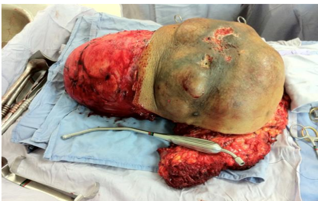
Figure 3: Macroscopic tumor. Piece obtained from the surgical procedure.

Magnetic resonance imaging shows a diffuse lesion of general botryoid morphology that presents heterogeneous ovoid components predominantly hyperintense in fat suppression and with post gadolinium centrifugal reinforcement with apparent extension to the left sacrotuberal ligament. Resection was performed with