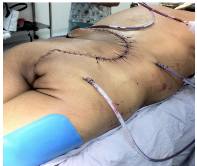
Figure 4: Immediate postoperative clinical photographs, reconstruction with advancement flap.

wide margins and reconstructed with contralateral skin flap advance (Figure 3 and Figure 4).