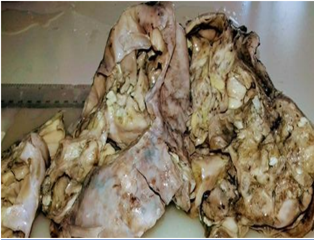
Figure 2: Gross photograph of immature teratoma of ovary-a cystic neoplasm with few focal solid areas.