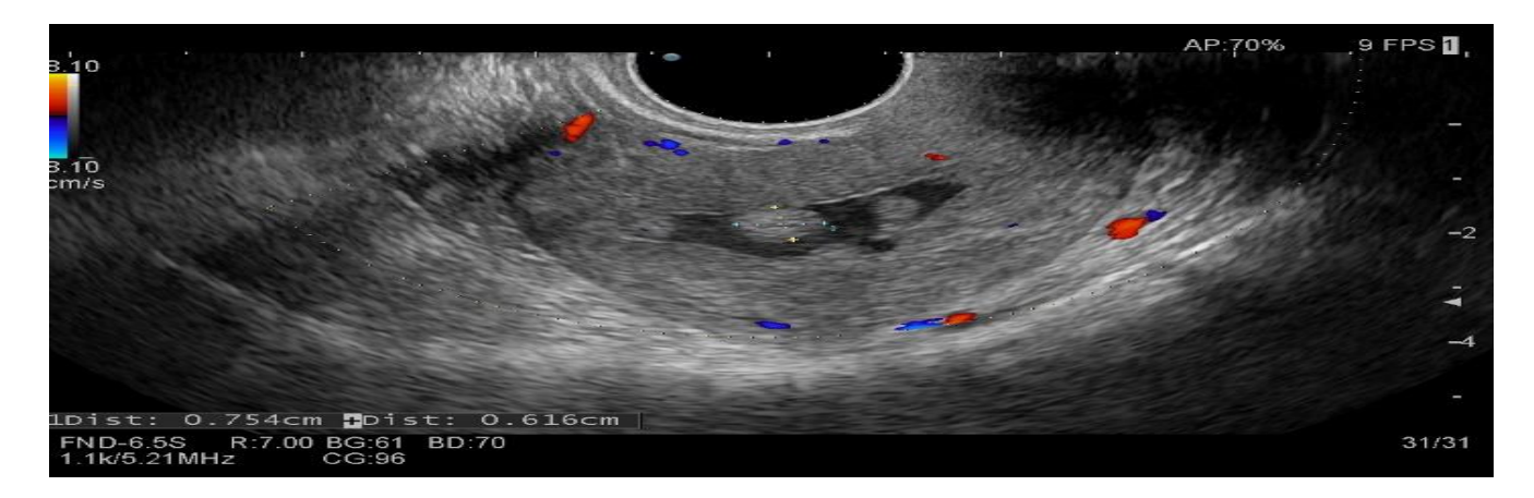
Figure 1: Transvaginal sonography showing multiple endometrial polyps surrounded by fluid in the endometrial cavity, largest one measuring 7.5x6.1mm in size.

unremarkable and the patient did not describe any vaginal bleeding. The pathological diagnosis was confirmed to be multiple small endometrial polyps.