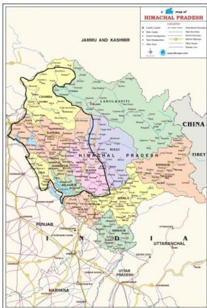
Figure 1: Map of Himachal Pradesh with black marked area served by RPGMC, Tanda.

Dr. Rajendra Prasad Government Medical College (RPGMC) is situated in district Kangra of hill state of Himachal Pradesh. It is the only major referral hospital in this part of the state serving to 7 districts comprising of 60% of the state population mainly of rural background (Fig 1). RPGMC serves to inhabited areas ranging from 600-4000 meters above sea level. The study was designed to evaluate whether the clinical profile along with risk factors of acute coronary syndrome is different in females as compared to males in the hilly state where the female to male ratio is 9:10 and where the females contributes predominantly in the agricultural work.