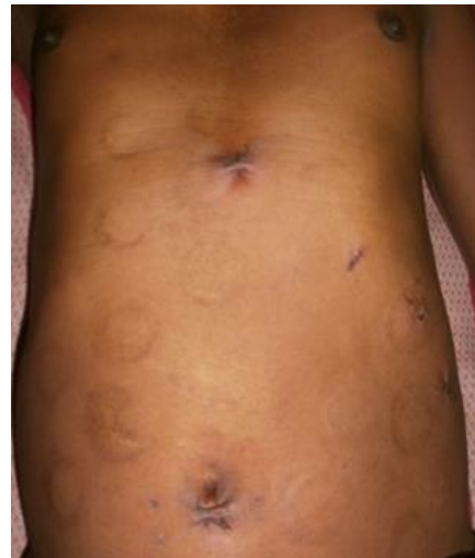
Figure 3: Post-operative picture of patient's abdomen showing sutured port sites.

The approach in the operating room required modification with the surgeon and the 1st assistant (camera surgeon) positioned on the right side of the patient and the 2 nd assistant, scrub nurse on the left side. A head-end-up and left-side-up positioning of the patient was adopted to optimize views of the gall bladder and the Calot's triangle. The monitor was placed at the head-end of the patient on left side. A 10 mm 300 laparoscope was introduced through transverse sub umbilical incision. Another 10 mm port was placed in the sub-xiphoid region just left to the midline. The other two 5 mm ports were placed in the left mid-clavicular and left mid-axillary lines about 5 cm apart (Figure 3).