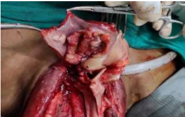
Figure 2: Further rotation reveals the cut on the cricoid and the inter-arytenoid region.