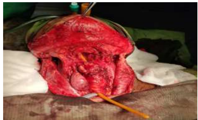
Figure 5: Fully developed voice conduit.