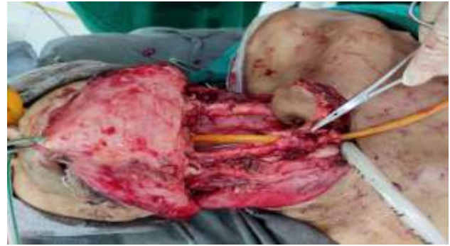
Figure 4: Voice conduit is fashioned around the foley's catheter while the neopharynx will be closed around the nasogastric tube. Patch PMMC flap is used to reconstruct the neopharynx.