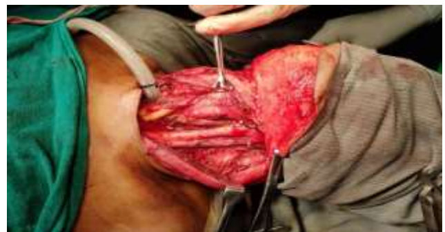
Figure 6: Neck dissection completed before proceeding to NTL.