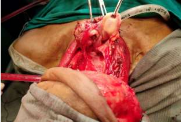
Figure 1: Cut through the supra-glottis on the uninvolved (Right) side extending from the epiglottis up to the anterior commissure. The picture shows involvement of the left PFS by tumour.

The foley's catheter is kept overnight for the shunt to fashion. Neck drains are removed 72-96 hours post operatively. Ryle's tube feeding initiated within 24 hours and patient is discharged once all drains and IV lines are removed, patient is clinically stable and taking oral feeding comfortably.