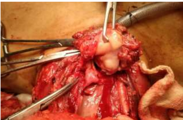
Figure 3: Disease involving the right AEF region. laryngeal cut through the left supra-glottis is seen.