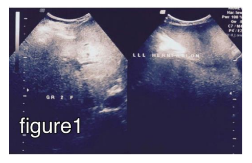
Figure 1: Usg finding of Liver herniation.

scan of abdomen and pelvis showed anterior abdominal wall defect of 7.5x6 cm with left lobe of liver herniating through the defect figure 1 and figure 2.