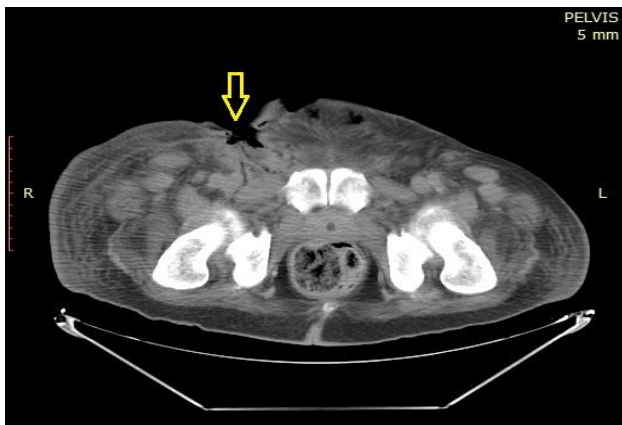
Figure 1: Ulceroproliferative lesion in the right inguinal region (arrow) infiltrating into the underlying muscles.

Computed tomography (CT) scan revealed large ulceroproliferative lesion in the right half of scrotum with heterogeneously enhancing margins and floor of the lesion infiltrating into the underlying muscles, shown in Figure 1.