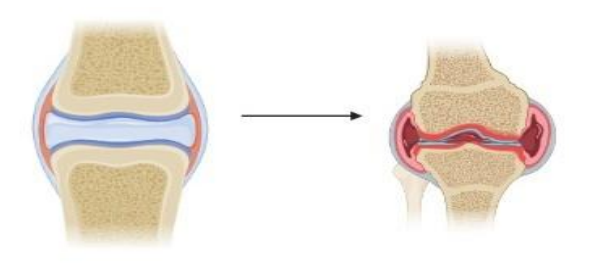
Figure 1: Progression of a normal joint to arthropathy.

The pathogenesis of hemophilic arthropathy essentially includes two main mechanisms which are synovitis and degeneration of cartilage. Joint bleeding is responsible for synovitis, resulting in synovial hypertrophy and vascular remodeling. The inflamed synovium develops plasmin, matrix metalloproteinases (MMPs), and pro-inflammatory cytokines such as interleukin (IL)-1β, IL-6, and factoralpha tumor necrosis (TNF \alpha ) that affects the cartilage. Synovial and pro-inflammatory are blood-derived cytokines that facilitates the production of hydrogen peroxide by chondrocytes. In the presence of erythrocytederived iron (Fe2+), hydrogen peroxide (H<sub>2</sub>O<sub>2</sub>) is able to react, resulting in the production of very toxic hydroxyl radicals (OH•) that induce chondrocyte apoptosis. Inflammation also stimulates the NF-nB Ligand (RANK-L)-RANK-osteoprotegerin (OPG)-pathway receptor activator, resulting in osteoclastic bone resorption. OPG guards the bones from excessive resorption by binding to RANK-L instead of RANK.<sup>10</sup>