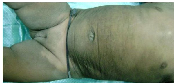
Figure 1: Child with hyperkeratosis all over the body.

soles. Superficial erosions ceased few months after her birth & followed by hyperkeratosis. Other sibling and parents are not affected. No family history of such diseases. Parents had consanguineous marriage. Careful examination of histopathology (Figure 2 & Figure 3) of hyperkeratotic lesion of skin shows hyperkeratosis, acanthosis with keratohyalinegranules in granular cell layer, sparse lymphocytic cells are seen around blood vessels. But there is no cleft noted in suprabasal layer. On the basis of clinical & histopathological feature epidermolytic hyperkeratosis was diagnosed.