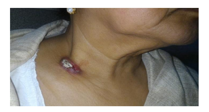
Figure 1: Ulcer on the lower neck.

largest measuring 3cm x 2.5 cm. The nodes were firm, mobile and tender on palpation. Overlying the lower part of the cervical nodes there was an ulcer with inflammation of surrounding skin (Figure 1). The ulcer was 3.5cm x 1.5 cm in size with indurated margins and it was discharging scanty serous fluids. Fibre-optic video laryngo-pharyngoscopic examination findings were normal.